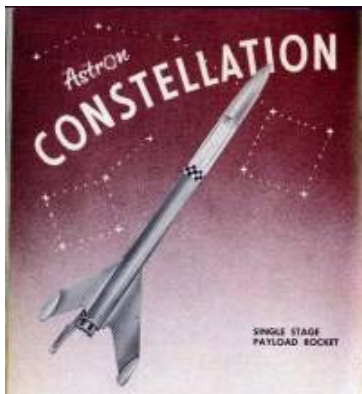
Estes Astron Constellation—1969

Several new members were added in January and February!