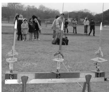
Nicely built Wizards, ready to launch as the Scouts wait in anticipation.