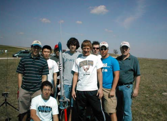
Left—Richland Hills High School poses with their 3-stage rocket. An outstanding flight as the rocket screamed straight up through the first two stages. Unfortunately, the third stage didn't ignite.