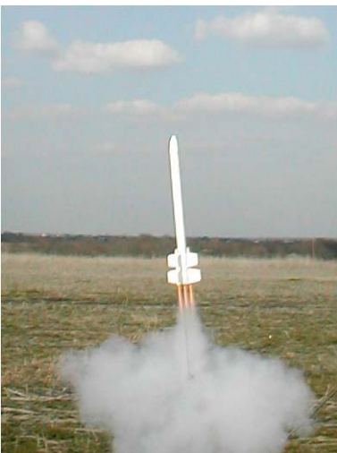
RHS team rocket blasts off the pad under triple-D power.