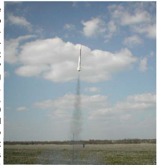
Below—NGHS launches its winning rocket to record height!