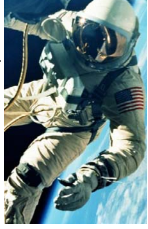
reach greater heights with your attendance at the club meetings.

Exit off Hwy 75 to East Plano Parkway (just north of George Bush Turnpike-Hwy 190) and go east, turn left on K St., and turn right into the shopping center just north of 18th St.