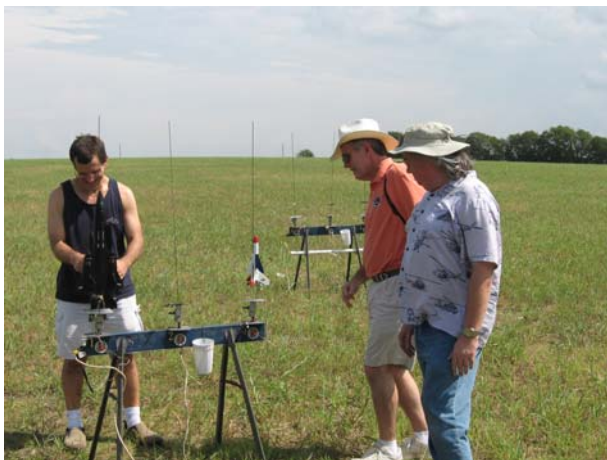
Right—My Hawks Hobby Super Trident is ready to fly. It is one huge rocket! Sweet!!