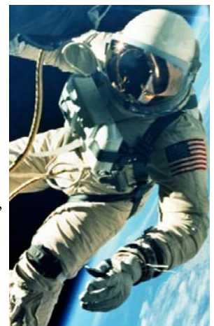
Stay connected! All of us will reach greater heights with your attendance at the club meetings.

Exit off Hwy 75 to East Plano Parkway (just north of George Bush Turnpike—Hwy 190) and go east, turn left on K St., and turn right into the shopping center just north of 18th St.