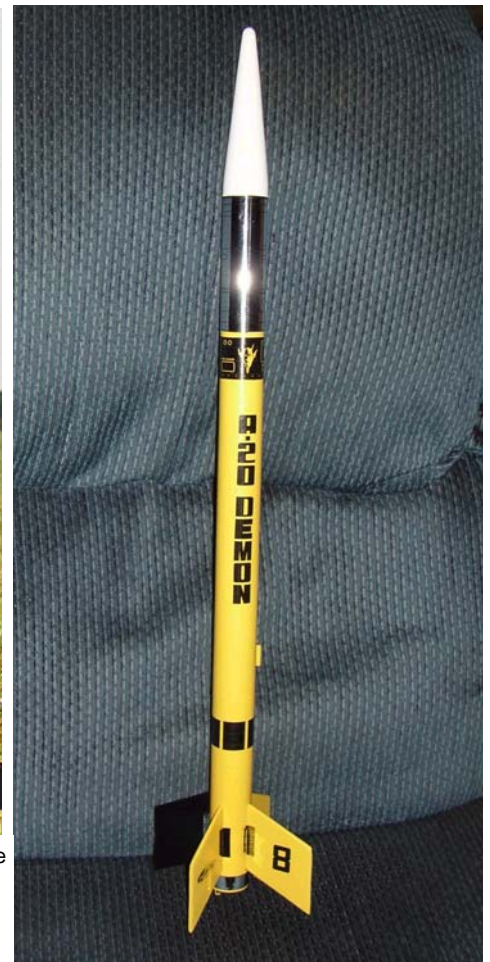
Right—A close-up of the completed model.