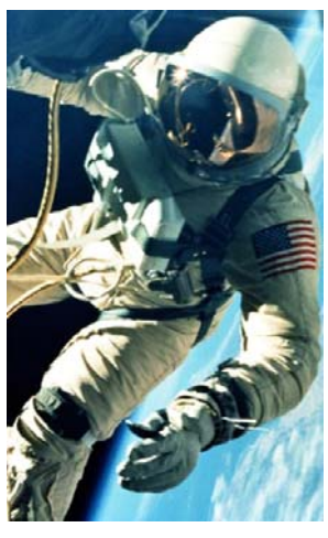
Stay connected! All of us will reach greater heights with your attendance at the club meetings.