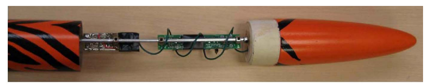
Same electronics bay installed in a Red River Rocketry P-Chuter Extreme