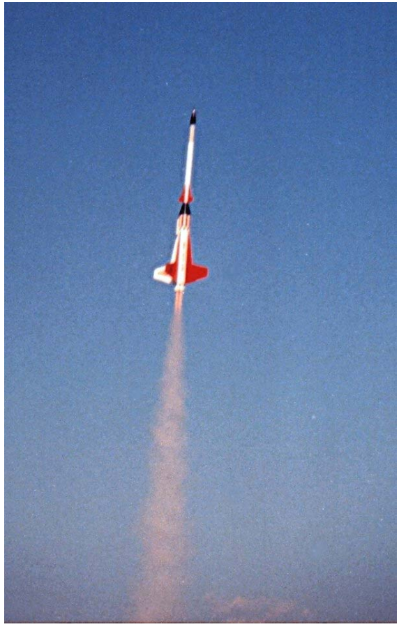
Stuart Powley's Semroc SLS Laser-X on 4 C6's.