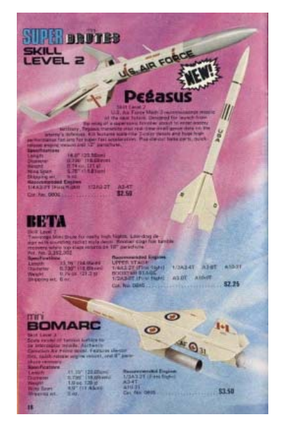
The Pegasus in the 1977 Estes Catalog

The order was at my door in a couple of days (again, you gotta love those guys at Semroc), and I put my new Ajax nose cone and body tube with the rest of the kit. All was right with the world. I then started looking at the extra body tube and nose cone that I ordered. They were really cool, but I still couldn't figure out exactly what to do with them. I decided to look in my old 1977 Estes catalog and see if inspiration struck. It was there, on page 18, that I saw the destiny of those parts.