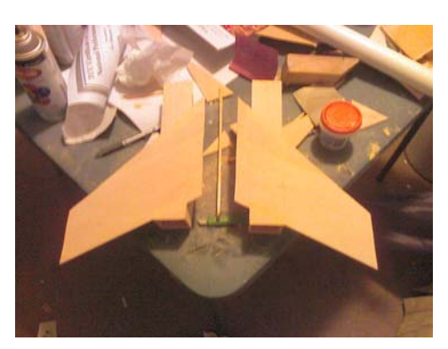
The Wings Prior to Attaching

I started building with the wings. Eleven parts, including the "engine pods," comprise each wing. In addition to these stock parts, I added a 1/8X1/8 inch strip to the top and bottom root edge on each wing. The reason for this is that even with using the epoxy rivet method of attaching the wings, I felt that there needed to be a wider root to anchor the wing to the body tube. These things are big, and I didn't want any wobbling in flight!