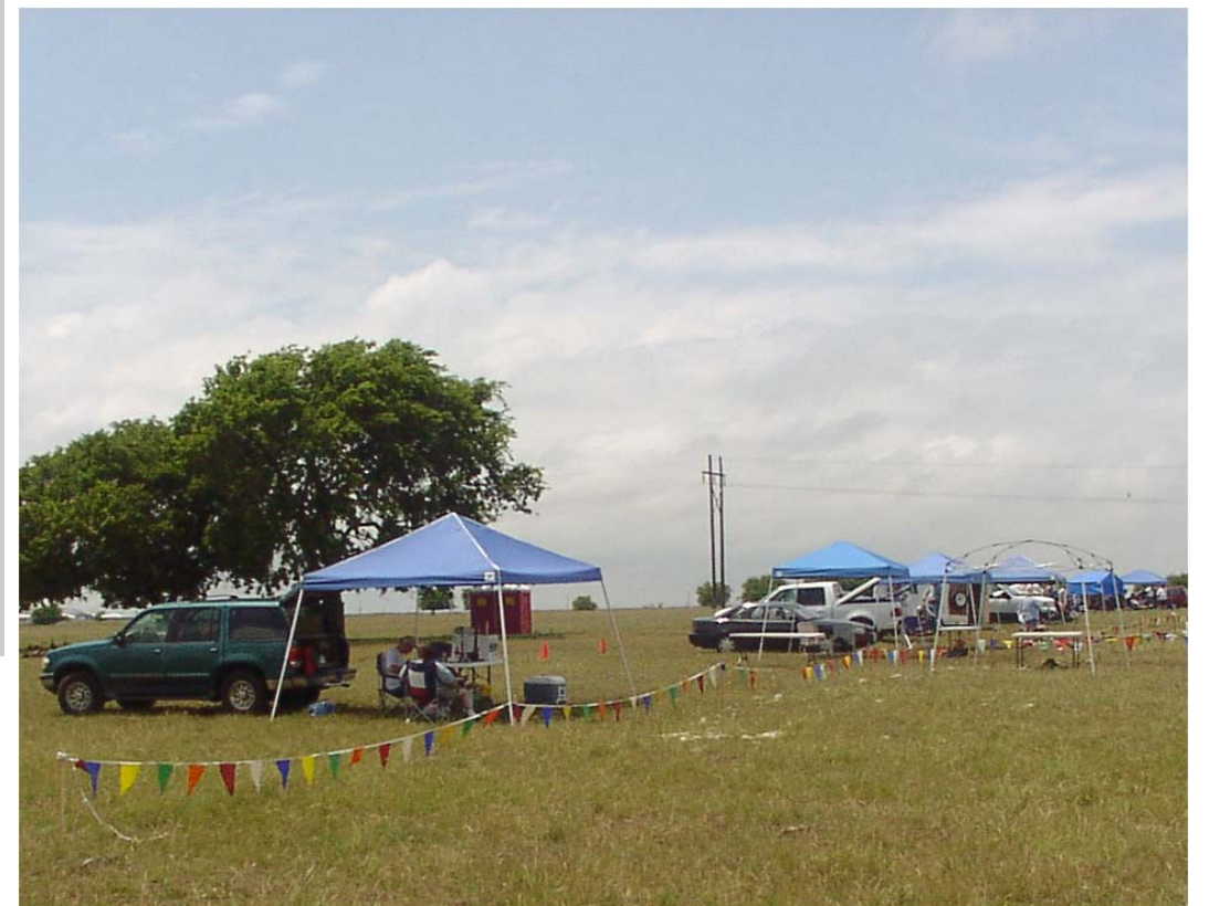
McGregor Field, Sunday, May 29, 2005.