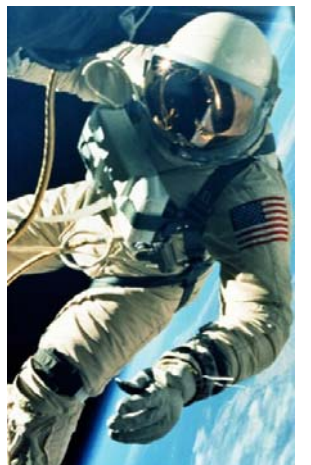
Stay connected! All of us will reach greater heights with your attendance at the club meetings.